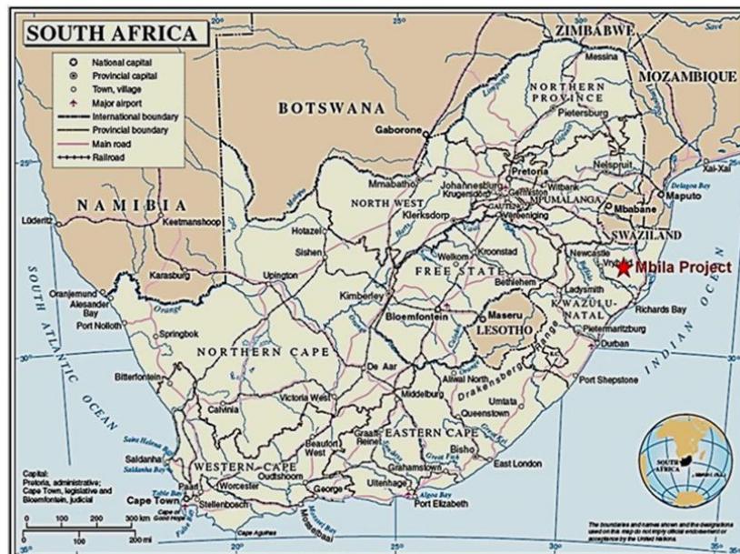
Figure 1: Mbila Project Location Map

The Mbila Project is located on Portion 9 of Reserve № 12 and № 15832 in the KwaZulu Natal Province of South Africa (Figure 1) and consists of the Mbila Mining Right (KZN30/5/1/2/2/186MR), covering 19,180Ha, and the Msebe Prospecting Right covering 52,946Ha (196/07/PR).