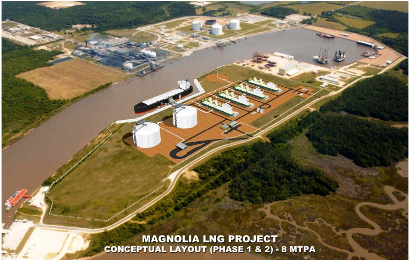
MAGNOLIA LNG PROJECT CONCEPTUAL LAYOUT (PHASE 1 & 2) - 8 MTPA