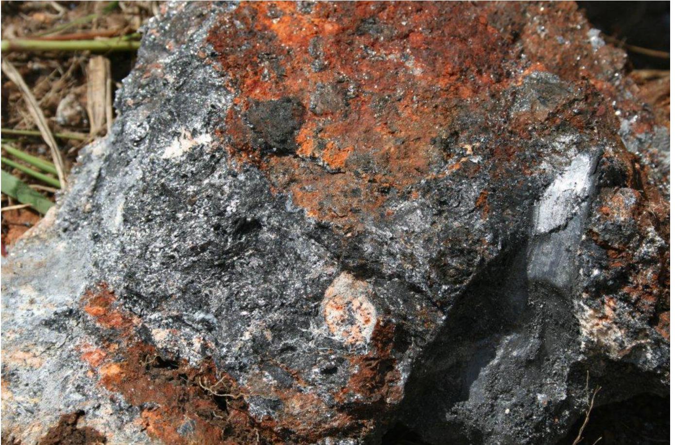
Figure 2 – High grade graphite sample

It has been estimated that this initial programme of work will take approximately 8 weeks.